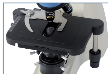
BIG RACKLESS MECHANICAL STAGE WITH ANTI SCRATCH GRAPHITE TREATMENT