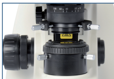
KOEHLER ILLUMINATION / SLIDING-IN ABBE BRIGHT FIELD CONDENSER