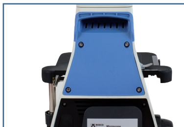
BACK HANDLE / POWER CORD WRAP