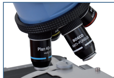
ANTI FUNGUS TREATED OBJECTIVES