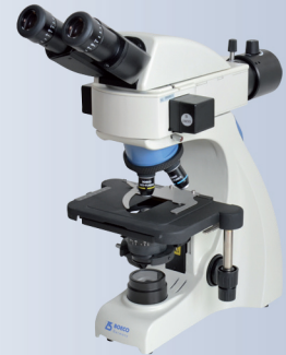
BM-700 WITH FL-LED